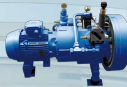
Booster on anti-vibration mounts