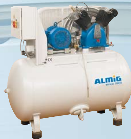
HL on receiver