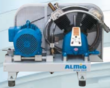
Booster on base plate