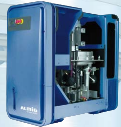
HP, in standard soundproof housing