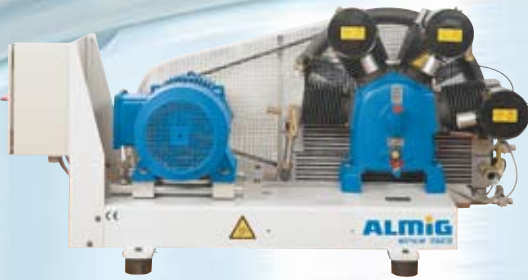
HL on base plate