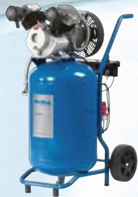
AT 6002 AT 7002