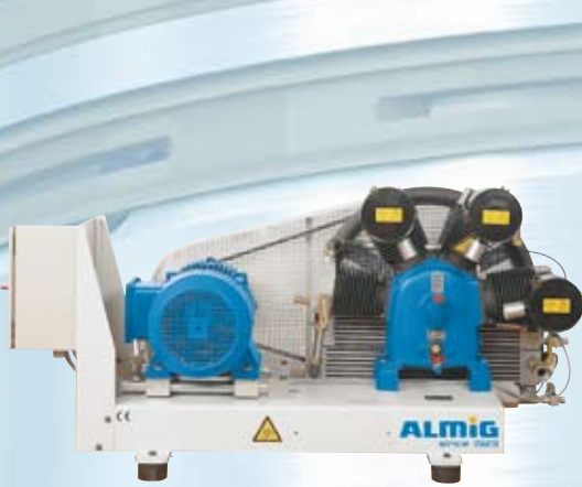
HL on base plate